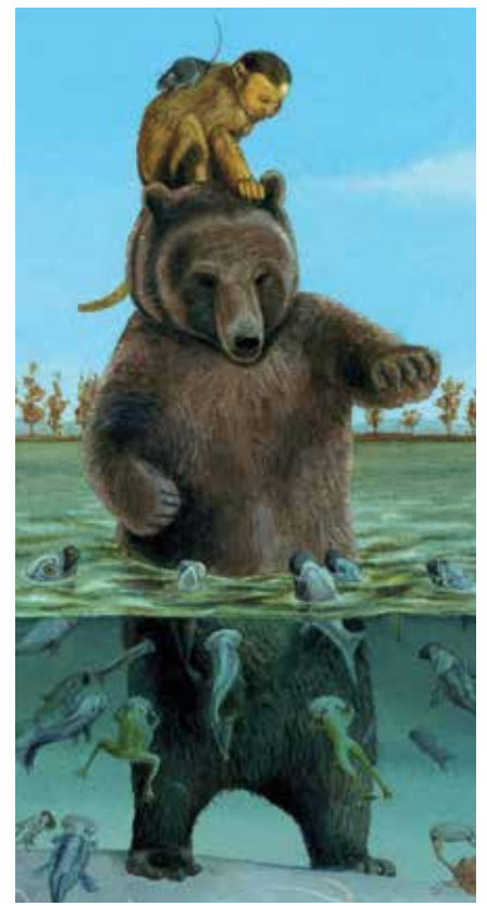
Illustration by Fabian Negrin