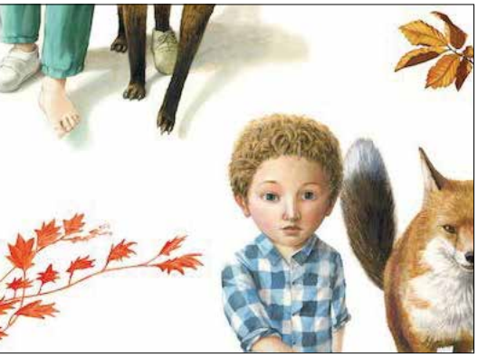
Illustration by Fabian Negrin