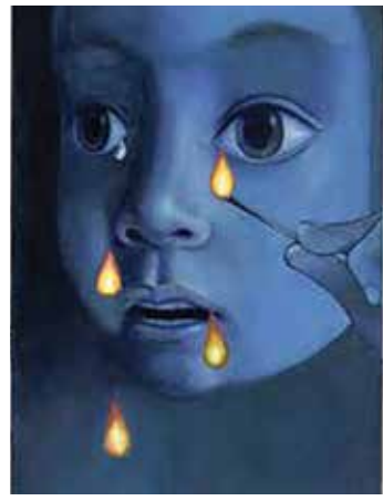
Illustration by Fabian Negrin

"Historicized Fiction or Fictionalized History? Lia Levi's First-World War Novel Cecilia va alla guerra (2000)"